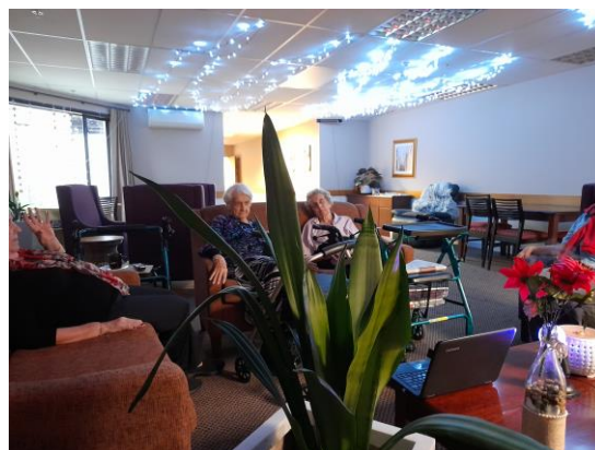
Enjoy aroma therapy in sensory room