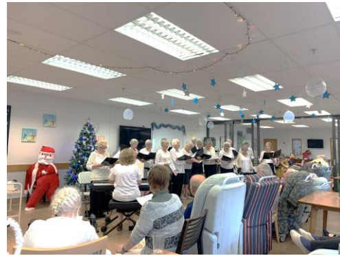
Independent Residents' Christmas Choir