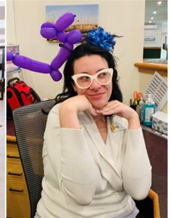
Fun at the Halloween Celebration