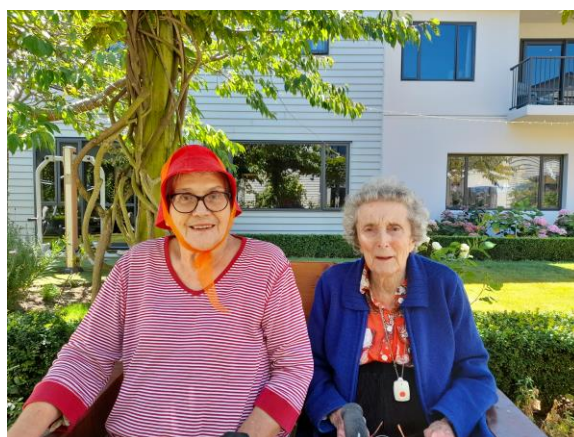
In the garden today. How lovely are the flowers?