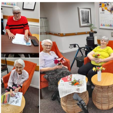
How amazing to do some art and flower arrangements.