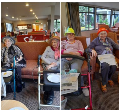
Melbourne Cup day! Hooray... Who's winning?

We enjoy relaxing with lavender essential oil and sensory lights.