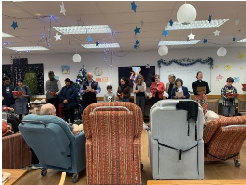
Cathedral of Saint Paul Christmas Choir